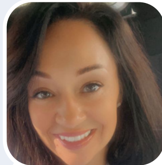
Jena Litrocapes Johnson & Johnson